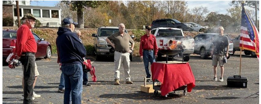
Old tattered and torn flags were retired and then burned according to the respected manner.

Thank you to all who participated and all the volunteers who helped make this a very special event.