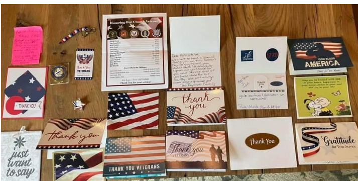
Here is a sample of the many cards some of our veterans are receiving from people throughout the United States, to say "Thank You."