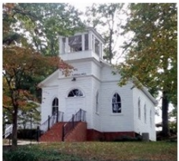
Mt. Airy Chapel 699 Grandview Avenue Mt. Airy, Georgia