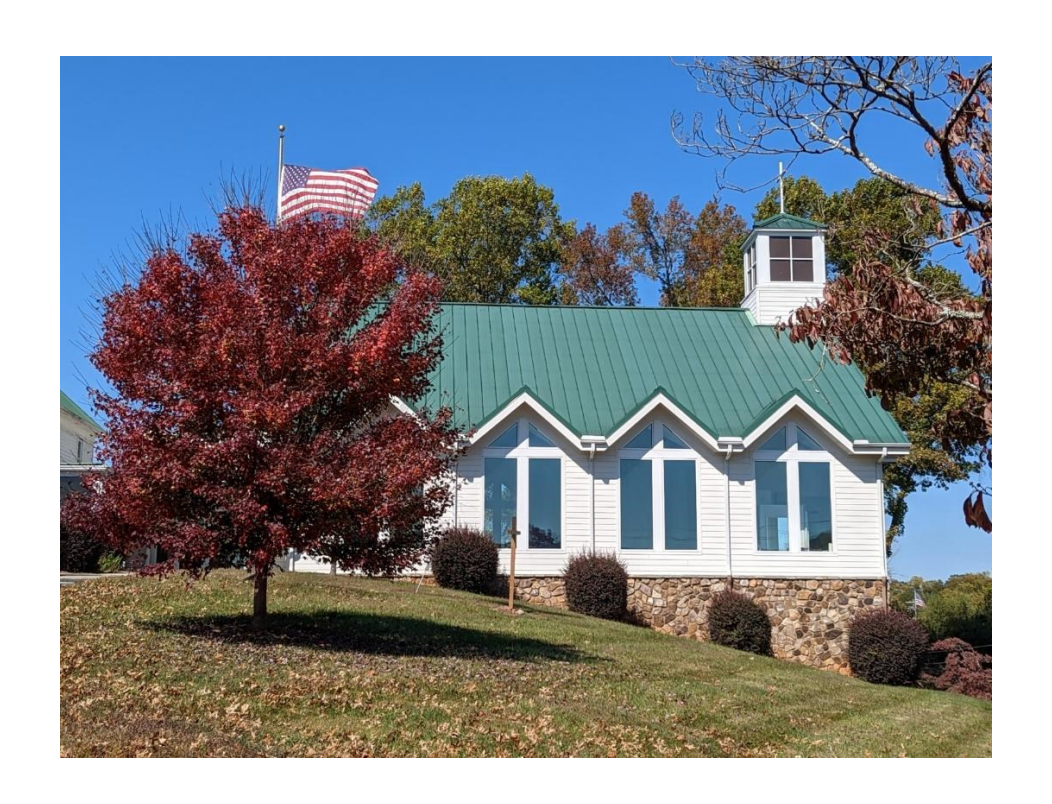
Growing together by sharing Christ's love